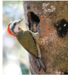
Cuban Green Woodpecker