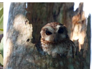
Cuban Bare-legged Owl