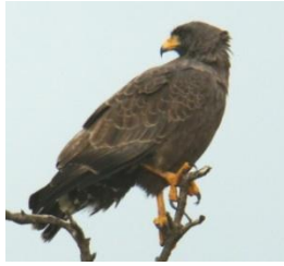
Cuban Black Hawk