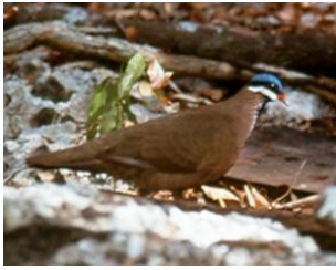
Blue-headed Quail Dove