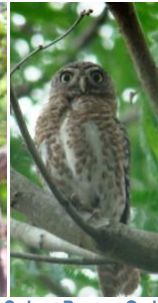
Cuban Pygmy Owl