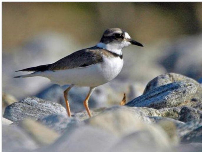
Long-billed Plover by Rich Lindie

habitats in the area also makes it one of the richest places for winter birding in Japan. The reedbeds fringing the rivers often harbour Chinese Penduline Tits, while Japanese Quail can sometimes be found amongst the rice fields. The rivers themselves hold Crested Kingfishers and the highly desirable Long-billed Plovers, and in the more wooded areas we should find fair numbers of Dusky and Pale thrushes. Some of the other noteworthy species we may encounter here include Green Sandpiper, Buff-bellied