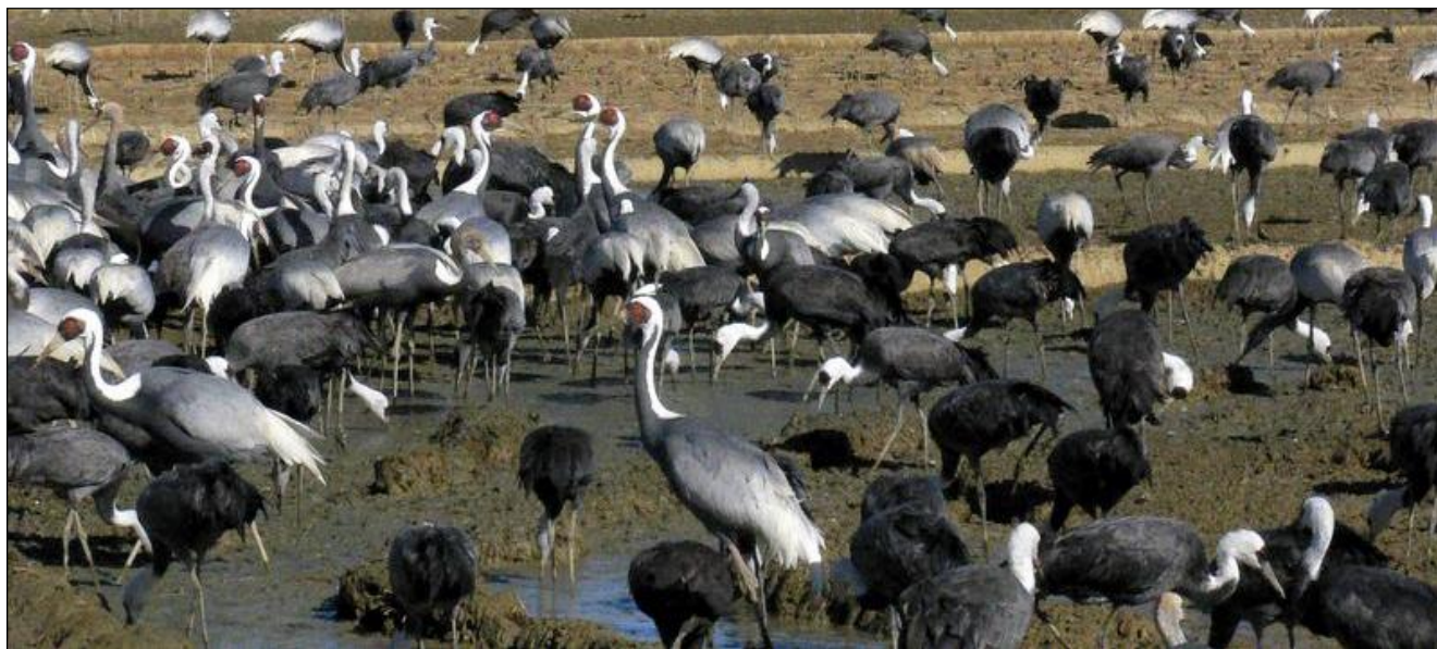
Hooded and White-naped Cranes by David Hoddinott

Days 13 & 14, 26 th & 27 th February: Arasaki and surrounds. We have two full days to explore the area around Arasaki. Our main focus here will be the fallow fields and rice paddies where thousands of Hooded and White-naped cranes congregate and feed. During good years, it is not unusual to count over