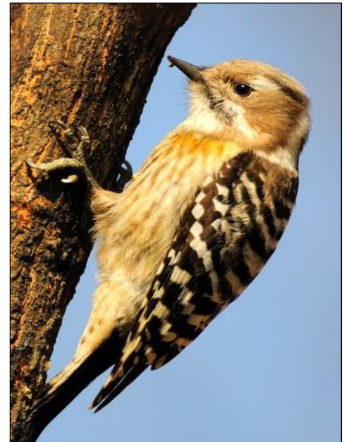
Japanese Pygmy Woodpecker by Rich Lindie

The remainder of the day will be spent exploring the woodlands in the area in search of the rare Ural Owl, elusive Hazel Grouse, and Black Woodpecker among the more common and widespread species like Red Crossbill, Eurasian Treecreeper, Goldcrest, Common Redpoll, and Eurasian Nuthatch. If we are extremely lucky we may also find Snow Buntings, Lapland Longspurs, Bohemian and Japanese waxwings, and even Pallas's Rosefinches, but any of these species would be a coup! Although these species regularly occur on Hokkaido, their numbers vary considerably from year to year and we will be very fortunate to locate any of these scarce passerines. In the late afternoon we will head back to our accommodation for a second night's stay.