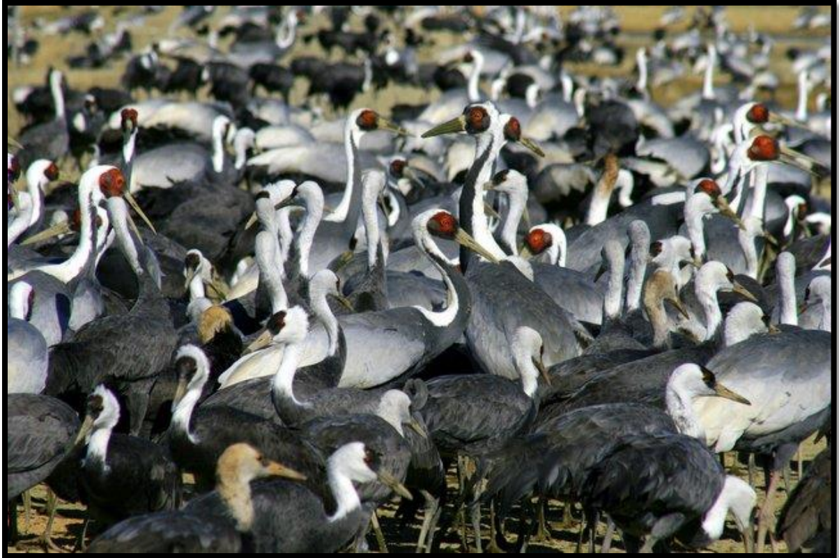
Honshu crane congregation

The island chain making up the country of Japan is undoubtedly a must-visit destination for the keen birder, and this exploration takes in the very best of what Japan has to offer.