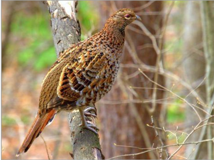
Copper Pheasant (female) by Glen Valentine

Day 2, 15 th February: Transfer to Karuizawa and afternoon birding. This morning we will board our vehicles and begin the drive to Karuizawa, situated in the forested highlands of central Honshu. After arrival, we will have some time to settle into our comfortable Japanese style hotel. Thereafter, we will begin our explorations of the prime birding area located just a few hundred meters from the hotel! Our main target here will be Copper Pheasant, a stunning bird endemic to Japan that only occurs on the main island of Honshu. The area around Karuizawa supports a rather healthy population of the species, yet due to its furtive habits we may have to work hard and be patient to see this special endemic!