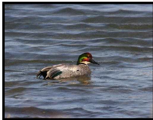
Falcated Duck by G. Valentine

Day 5, 18 th February: Nagano to Kaga. After a final morning in Nagano, we will head for the Komatsu region on the western (Sea of Japan) coast of Honshu for a two-night stay. Today is mostly a travel day but, if time allows, we will do some initial exploration in the Kaga area. This could include a visit to a large lake near the town of Kanazawa that harbours an impressive array of waterfowl during the winter months and we are likely to encounter Smews and Falcated Ducks. If we are fortunate, perhaps a couple of Baikal Teal will be amongst the masses of other more common and widespread species. The lake edge may reveal Bull-headed Shrikes and Japanese Green Pheasants. In the late afternoon we will arrive at our accommodation in the Kaga area.