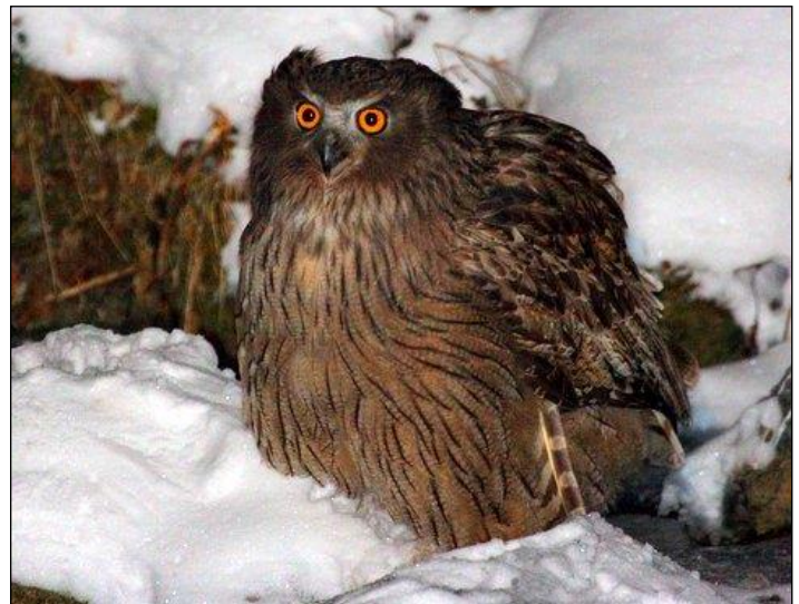
Blakiston's Fish Owl by Glen Valentine

Day 9, 22 nd February: Rausu and surrounds. We have the entire day to explore the surroundings of Rausu, which will likely include sifting through mixed forest flocks for species such as Hazel Grouse, Black Woodpecker, Common Redpoll, Red Crossbill, Brambling and Eurasian Bullfinch. A scan out to sea should be productive, with this area being especially good for waterfowl and loons. Here we may find Red-throated, Black-throated, and Pacific loons, Long-tailed and Harlequin ducks, Common Goldeneyes, Common and Red-breasted mergansers, White-winged and Black scoters, and Ancient Murrelets. Small, icy streams may yield the captivating Brown Dipper, while a scan of the surrounding forested hillsides could produce Sika Deer. Tonight we will have a second opportunity to look for the regal Blakiston's Fish Owl.