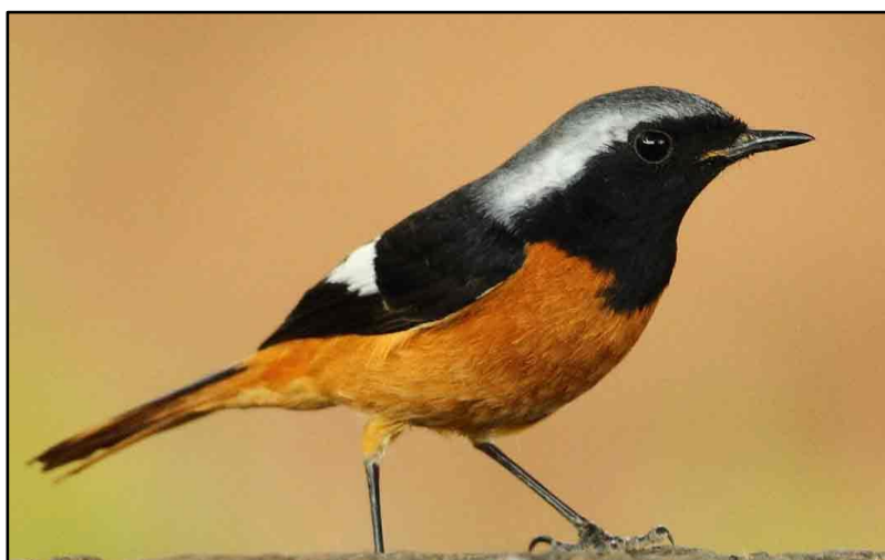
Daurian Redstart by Markus Lilje

Day 17, 2 nd March: Lake Mi-ike area and flight to Tokyo. This morning we will have time for some final birding around Lake Mi-ike to search for any species we may not have encountered there on our