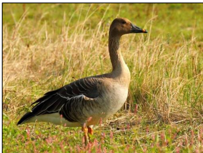
Taiga Bean Goose by Glen Valentine

Day 6, 19 th February: Kaga. The area around Kaga, in particular the Katano Kamo-ike Wetland Reserve, hosts staggering numbers of waterfowl in winter. We will work patiently through the vast flocks and are likely to be rewarded with good, scope views of Baikal Teal, sometimes in their hundreds! Taiga and Tundra Bean geese are also usually present, along with a few Falcated and Mandarin ducks and Smews. The majority of the waterfowl will however consist of Eastern Spot-billed and Tufted ducks, Northern Shovelers, Eurasian Wigeons, and Mallards. Venturing out towards the fields close to the Komatsu Airport usually produces large numbers of Tundra Swans, mostly comprising the bewickii subspecies (Bewick's Swan) but occasionally supporting a few of the columbianus subspecies (Whistling Swan).