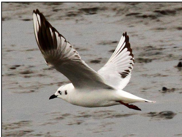
Saunders's Gull

Day 12, 25 th February: Nemuro to Kushiro, fly to Fukuoka and drive to Arasaki. This morning we begin our journey back to Kushiro from where we board our domestic flight to Fukuoka, a large city situated on the northern coast of the island of Kyushu. We may have time to stop in again at the Nemuro Peninsula to search for any species we may have missed the day before and we may also take some time out to bird around Cape Kiritappu in search of the scarce Asian Rosy Finch.