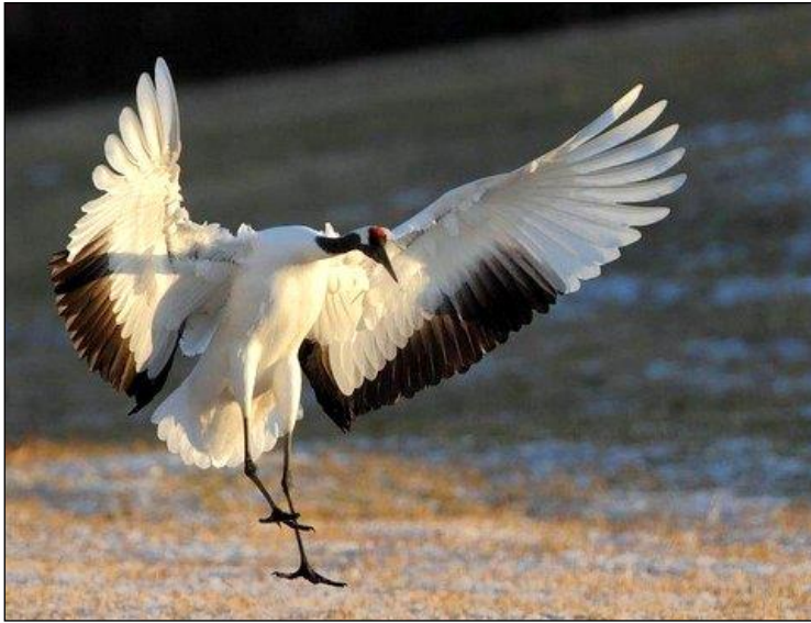
Red-crowned Crane

Day 7, 20 th February: Flight from Kaga to Kushiro, Hokkaido and transfer to Tsurui. After some final time in the Kaga area we will transfer to the airport to connect with a domestic flight to Kushiro on Japan's northern island of Hokkaido. Upon arrival we will drive to the town of Tsurui where we will overnight. We are likely to arrive in the late afternoon.