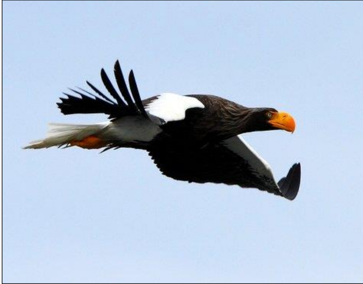
Steller's Sea Eagle by Adam Riley

Day 10, 23 rd February: Rausu to Lake Furen. Driving from our hotel in Rausu, we will follow the coast south towards the frozen Lake Furen. On our way we are likely to see Large-billed Crows, Glaucous and Glaucous-winged gulls, and large numbers of Whooper Swans. In this area we may also find White-tailed and magnificent Steller's sea-eagles. These birds can usually be seen in good numbers and are often seen flapping heavily as they move from one feeding area to another. In the afternoon we will settle into our accommodation and some birding nearby may yield Marsh and Willow tits, as well as the local subspecies of Eurasian Nuthatch.